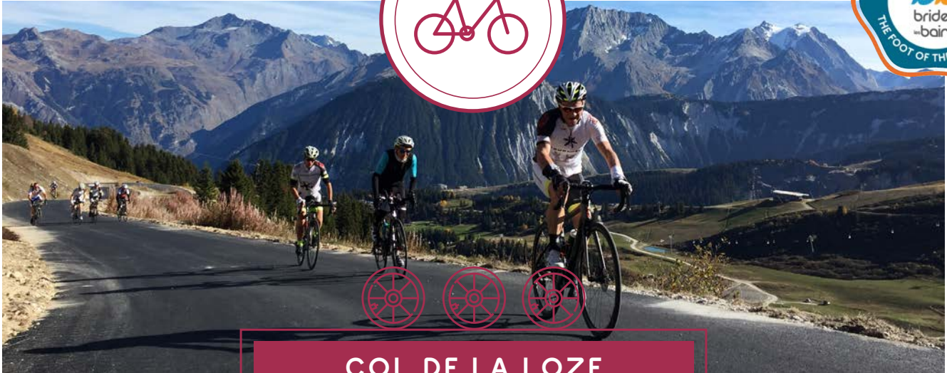
COL DE LA LOZE